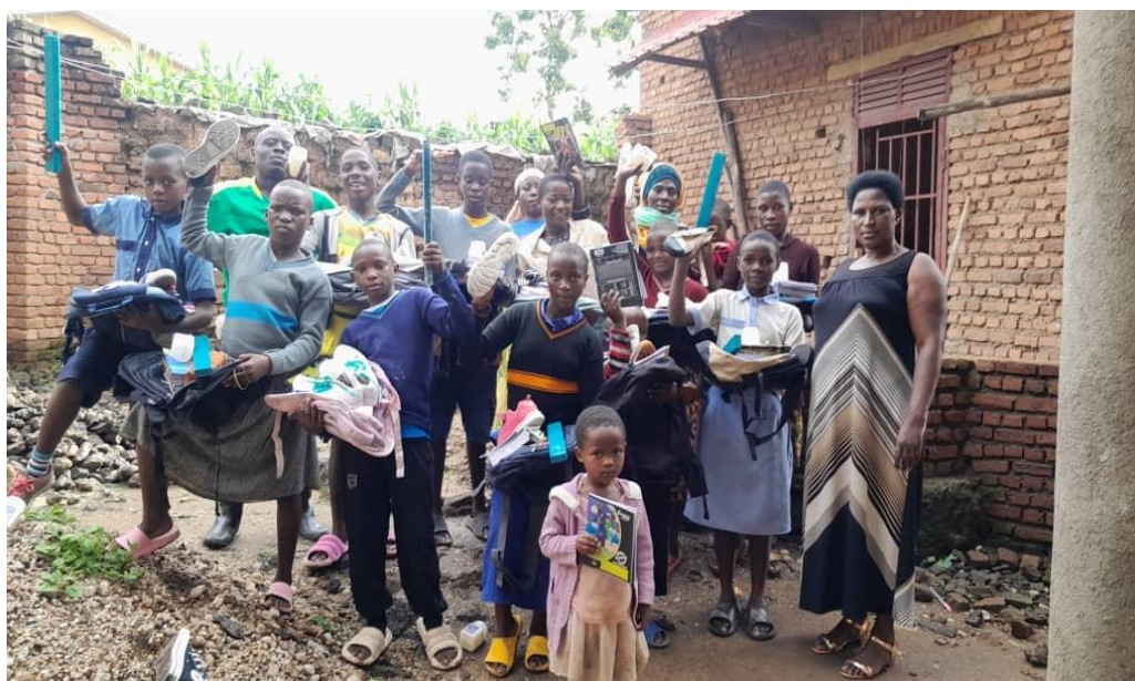
FIGURE 3 BAHONEZA CHILDREN RECEIVING SCHOOL MATERIALS