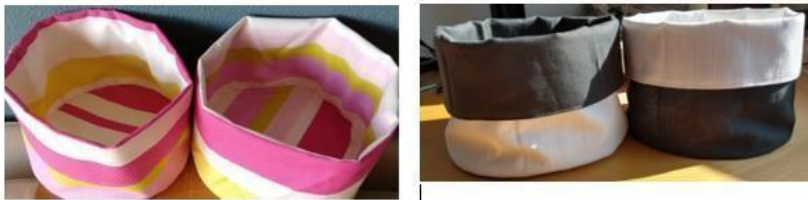
FIGURE 5 BREAD BASKETS