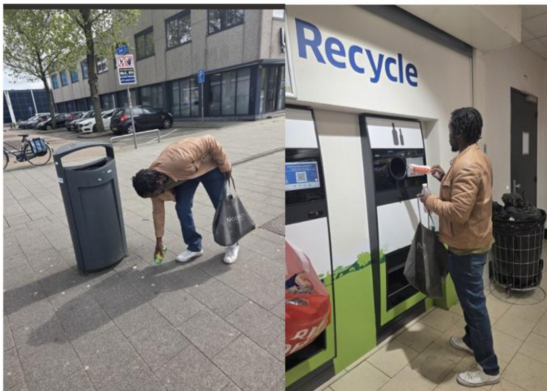
FIGURE 6 BOTTLE DEPOSIT COLLECTION

Innocent collects deposit bottles and cans for Stichting Jyambere.