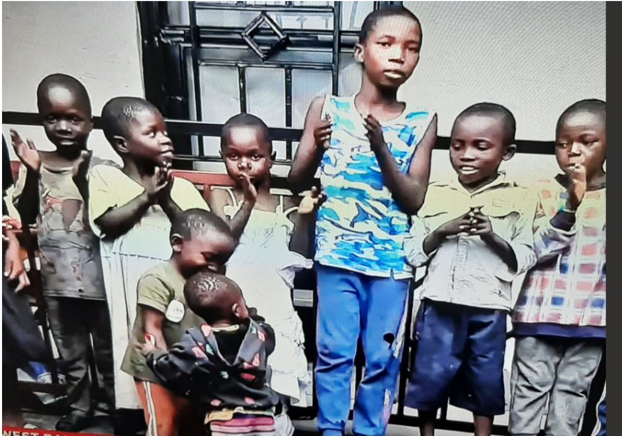
Figure 3 Children who have fled Goma

Jyambere wants to sponsor children from Mahoko in collaboration with the Bahoneza project.