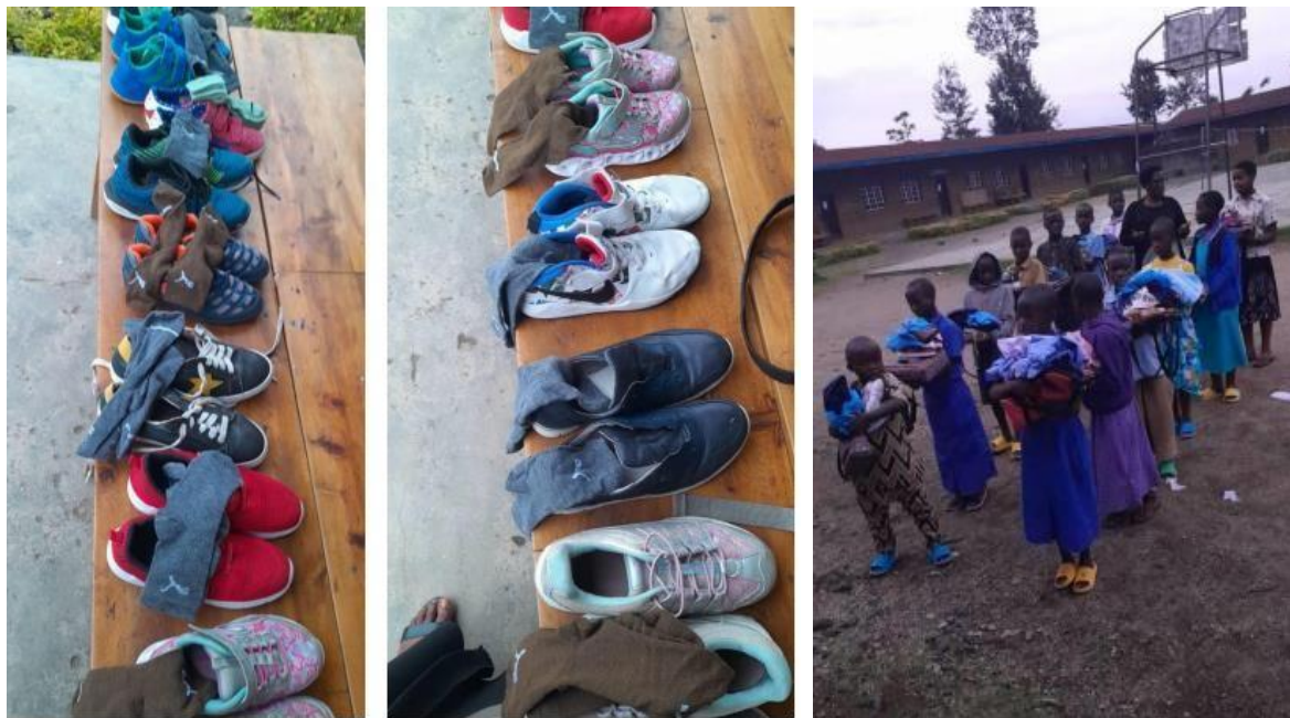
Figure 4 Receiving sponsored clothing

provided financial support so that the children of Jyambere could complete the 2023-2024 school year.