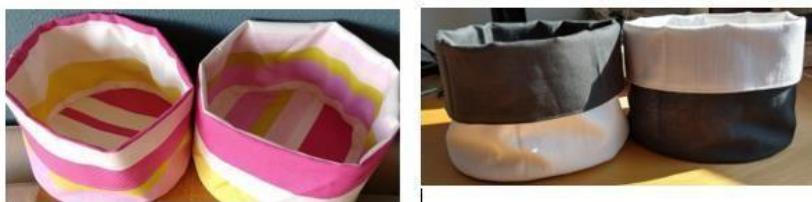
Figure 5 Bread baskets

Mrs. Sien makes bread baskets and sells them. The proceeds are intended for the Jyambere foundation.