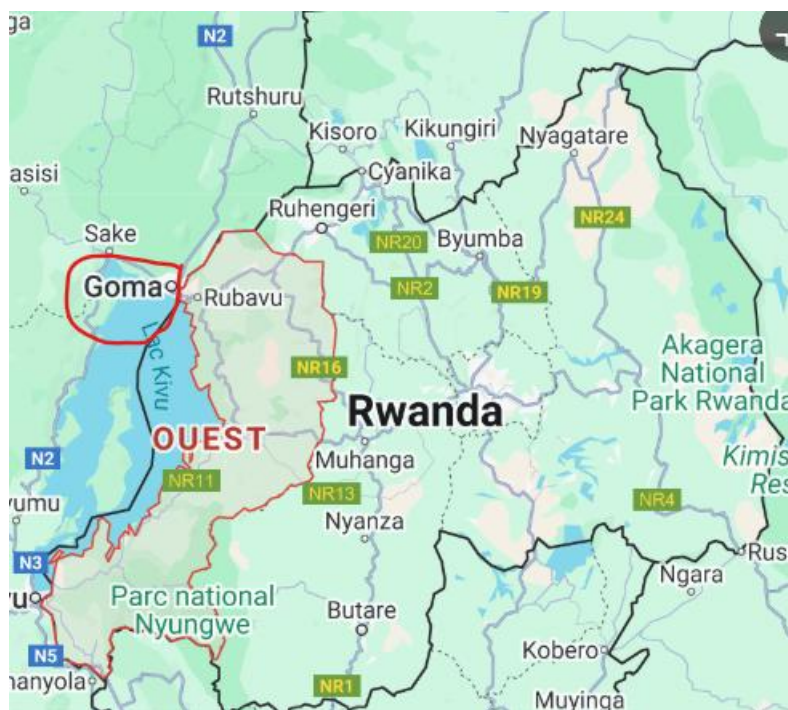
Figure 1 Goma city in Congo and Rubavu in Rwanda

For clarification, we will show internet links of the source of the information. For those who can read and understand English or Kinyarwanda, the original text contains additional information. The humanitarian situation in the city of Goma, eastern Congo was very tense at the end of 2024. Goma is a city of an estimated two million inhabitants, located on the border with Rubavu in Rwanda. The city is occupied by M23 time and time again. The city is now back in the hands of M23 and there were more than 2000 deaths in 2024.